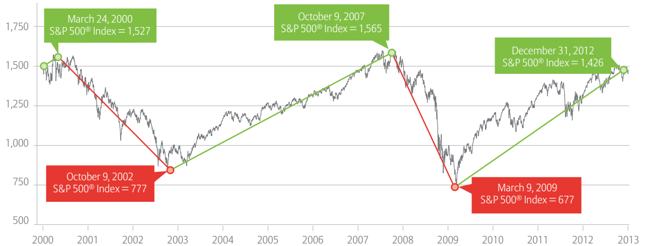
The above time period was chosen as an example to illustrate two complete cycles of recent volatility in the S&P 500® Index from 1/1/2000 to 1/1/2013.

The advantages of a fixed index annuity with annual reset